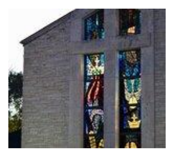
Exterior view of First Methodist Church of Mineola