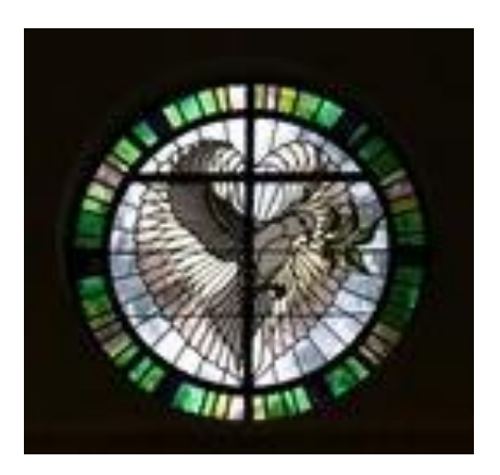
Window at the Holy Spirit Catholic Church at Holly Lake Ranch