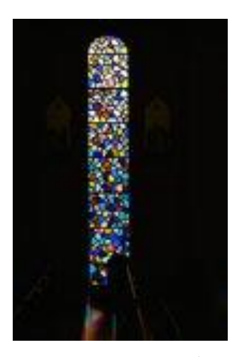
St. Peter the Apostle Church of Mineola