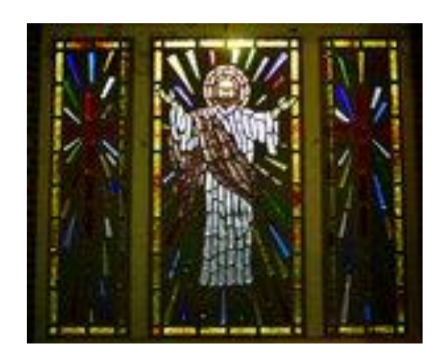
St. Paul Missionary Baptist Church of Mineola from the original structure.