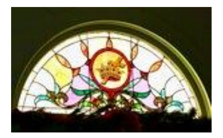
First Presbyterian Church of Winnsboro.