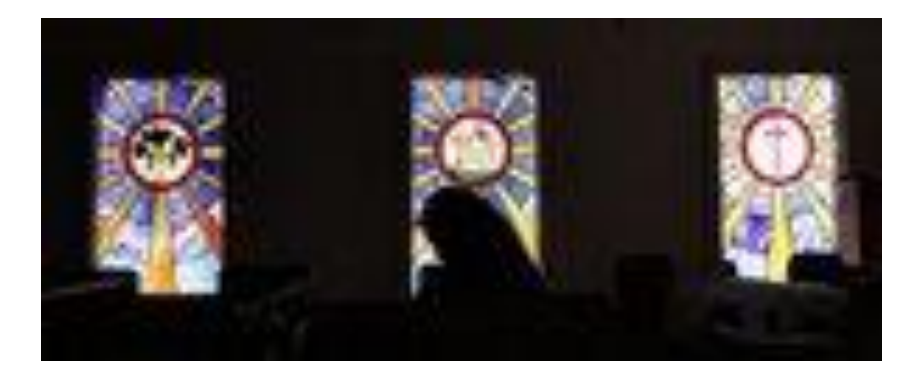
Tinney Chapel United Methodist Church in Winnsboro